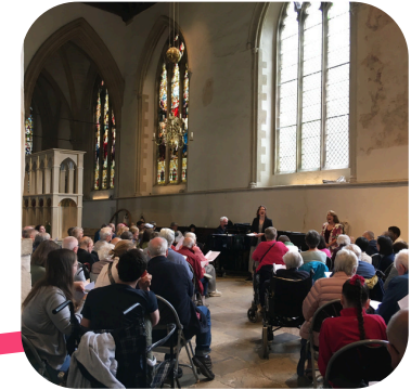
Concert location: in the Abbey Shrine Chapel, with flexible seating & ramps for access