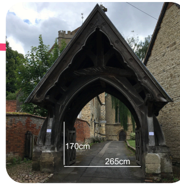
Access to Abbey grounds via wooden gateway